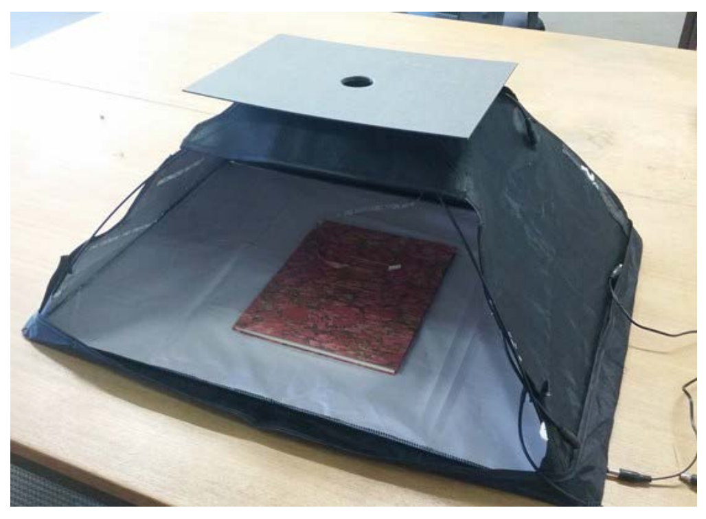
Figure 2 ScanTent - prototype

The following pictures provide a first impression of this prototype.