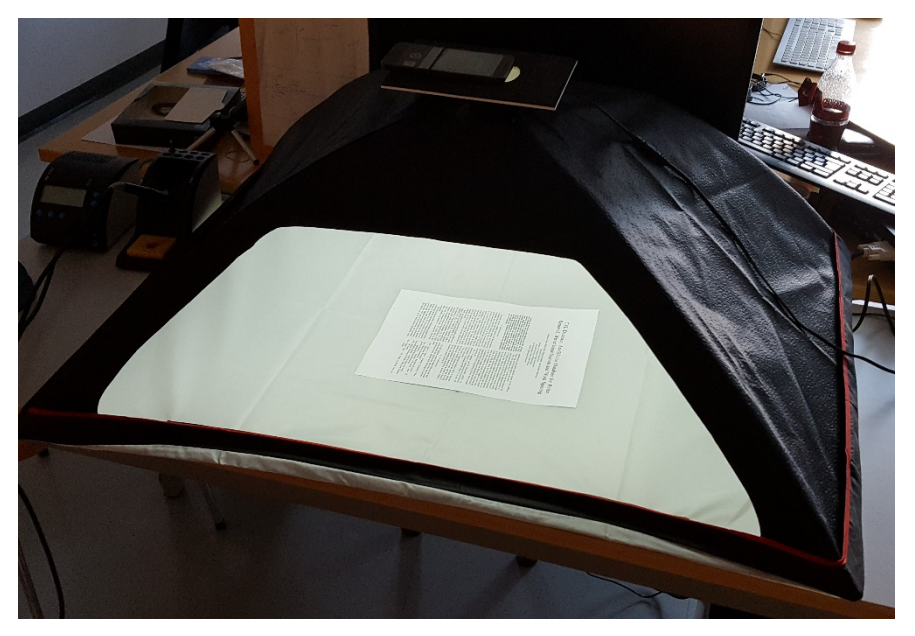
Figure 5: ScanTent – prototype with 3D plotted mount for the smartphone

The following images where taken with a Samsung Galaxy S5. Resolution is about 300 ppi and fully sufficient for any further processing, such as Text Recognition, Writer Identification or similar processes such as face and object recognition.