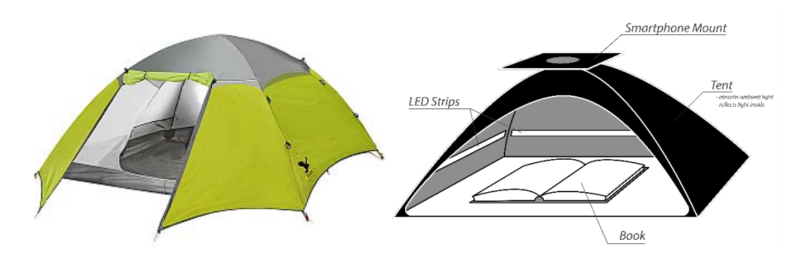
Figure 1 Typical "dome tent" with its characteristic form (here from the Italian company Salewa) and a sketch of the planned ScanTent

The main features of such a "ScanTent" are: