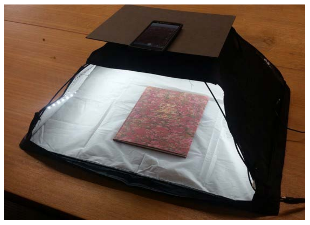
Figure 3 ScanTent - prototype – lights turned on