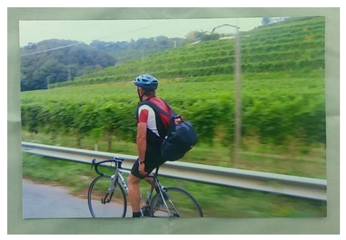
Figure 7 Picture taken from a photo

Based on these encouraging results we will continue our tests in 2017 and come up with a reproducible prototype for further testing in real world situations.